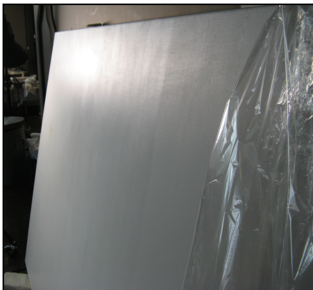
During treatment image of Bernard Cohen's 'Painting with Three Spots, One Blue and Two Yellow' (T01538). The vertical cleaning line and variations in surface gloss can be seen in raking light (from the left). Image Tate, 2009 © Bernard Cohen.